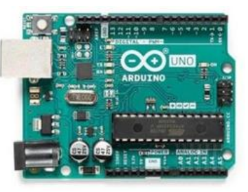
Fig. 4. Arduino UNO

Arduino UNO is a microcontroller development board and is known as the most basic board of the entire Arduino family. It is a simple sensor that is used to build the circuits and interfaces for interaction and telling the microcontroller how to interface with other components (Seneviratne, 2017).