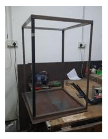
Fig. 9. Building the bin framework