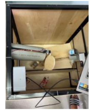
Fig. 12. Product setup and testing