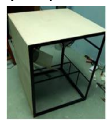
Fig. 10. Installing the plywood to the frame