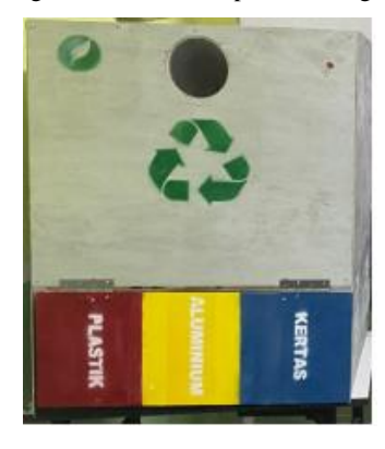
Fig. 13. Final appearance of the product