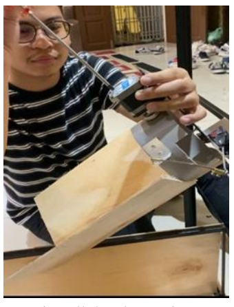
Fig. 11. Connecting all the electronic part to the bin