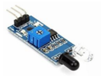
Fig. 5. Infrared sensor

and fast obstacle detection via infrared reflection. As it is based on light reflection, the detection does vary with different surfaces. The output is digital signal, so it is easy to interface with Arduino UNO. This sensor typically has an IR LED & an IR photodiode.